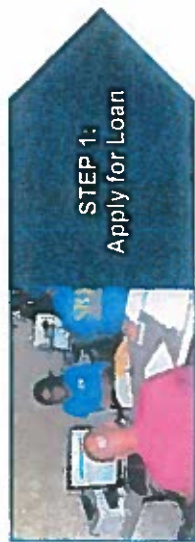
STEP 1: Apply for Loan

The U. S. Small Business Administration (SBA) provides low-interest, long-term disaster loans to businesses of all sizes, private non-profit organizations, homeowners, and renters to repair or replace uninsured/underinsured disaster damaged property. SBA disaster loans offer an affordable way for individuals and businesses to recover from declared disasters.