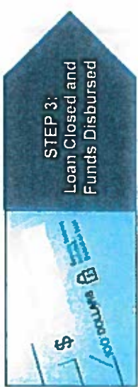
STEP 3: Loan Closed and Funds Disbursed