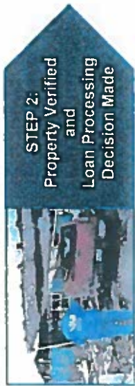
STEP 2: Property Verified and Loan Processing Decision Made